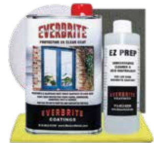
EVERBRITE GARAGE DOOR RENEWAL KIT