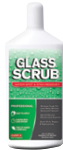
GLASS SCRUB® WATER SPOT & STAIN REMOVER

Ammonia-free; contains perfume-grade alcohol for best performance.