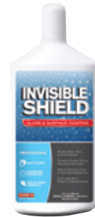
INVISIBLE SHIELD® PROTECTIVE GLASS & SURFACE COATING

Perfect for glass, porcelain, ceramics, and other hard surfaces such as granite and tile.