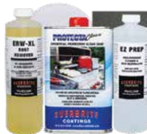
PROTECTACLEAR STAINLESS STEEL CLEANING KIT

Removes old or heavy accumulation of greasy film, food spatter, or oil stains.