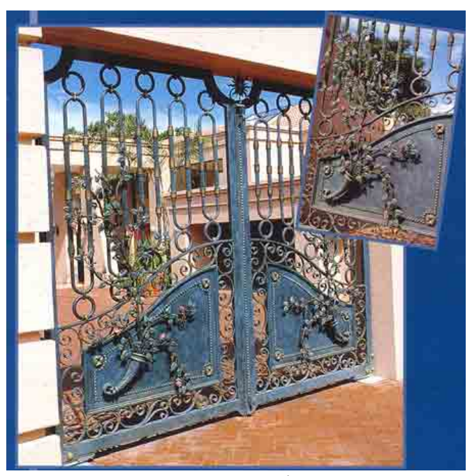
Peter's Metal Studio - Entrance Gate (Johannesburg, South Africa)