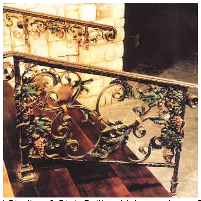
Peter's Metal Studio - 3 Stair Railing (Johannesburg, South Africa)