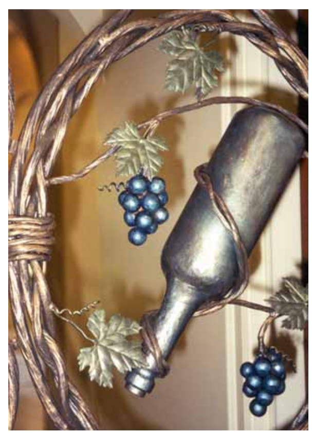
Grainger Metal Works - Wine Cellar Door (Conway, SC)