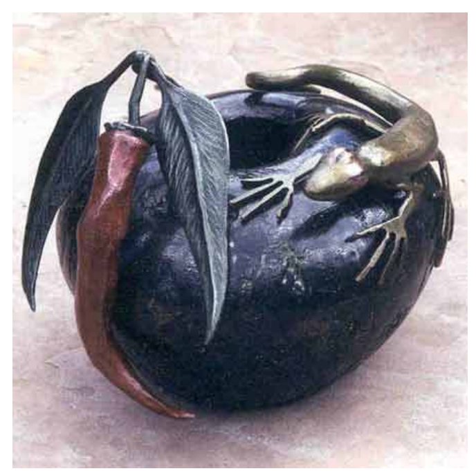
Chili Pepper & Lizard