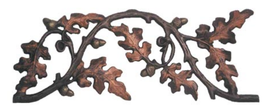
Oak Leaf Casting