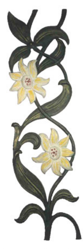
Flower Yellow Casting